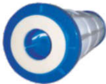
FCPNNx-M Single open end cartridge

Nominal micron rating: 20, 50, 100, 150 microns Lengths: 10" (250 mm +/- 1 mm) Outer diameter: 2 1/2" (69 mm +/- 1 mm) Inner diameter: 1.1" Min. feedwater temp. 2°C (35° F) Max. feedwater temp. 70°C (158° F) Avg. Efficiency: 90%