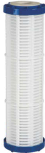
How FCPNNxM works