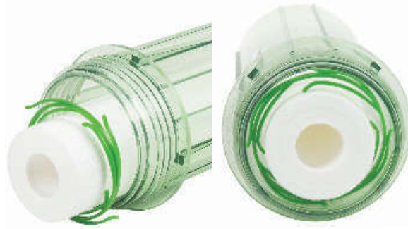
Filter Housing with Centralizing Ring. Filter cartridge is stabilized in the center of the housing.

Reduces the risk of damage to the cartridge and housing elements at installation.