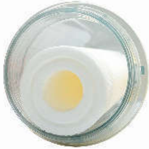
Filter Housing without Centralizing Ring. Filter cartridge falls to the side, unsupported.

Antibacterial and Antimicrobial Filter Cartridge Centralizing Ring